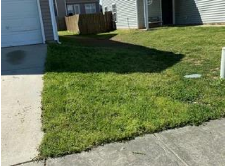
Lawn needs mowed and edged

In general, lawns should be mowed weekly starting in early March through late October. In the autumn and winter months, lawns should be mowed every other week. Lawns need to be edged along the sidewalks, drives and curbs. Lawns need to be monitored and treated with approved fertilizers, weed killers, insecticides, and fungi treatments throughout the year. Lawns need to be watered per the city guidelines mentioned earlier.