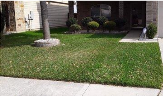
Lawns properly maintained

Shrubs need to be trimmed and the plant beds kept weed free year-round.