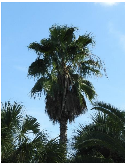
Trees need trimmed

Most palms need to be trimmed twice a year. Once after flowering/seeding in the spring (May/June) then again in the autumn. Dead palm fronds attract insects and rodents. During a drought they can become a fire hazard. For hurricane force winds they become projectiles. Trimming palm trees benefits your property and your neighbors.