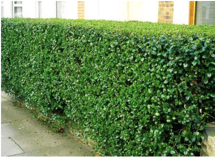
Hedge trimmed properly