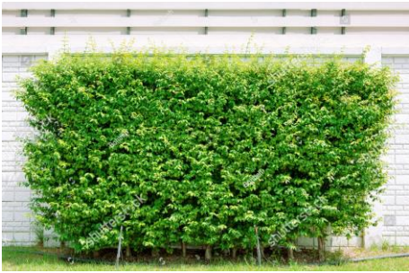
Hedge needs trimmed.

Shrubs need to be trimmed and the plant beds kept weed free year-round.